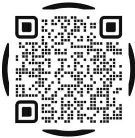
Double Owl Pathway Info

Double Owl Pathways afford undergraduate students the opportunity to obtain their undergraduate and graduate degrees faster and at a significantly lower cost than if they pursued each degree independently. By bundling both degrees into Pathways, highly motivated and committed students will graduate sooner than their peers and with a head start on their careers. KSU has a variety of Pathways to choose from.