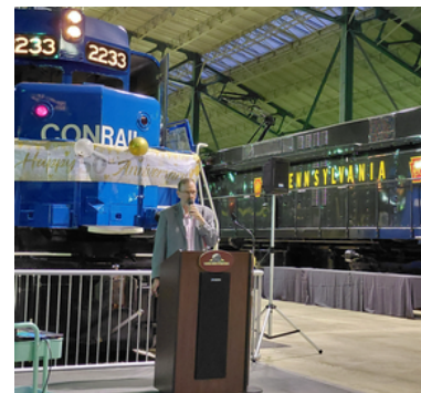
Keynote Address (50 th Anniversary) - Sept 27 th , 2025