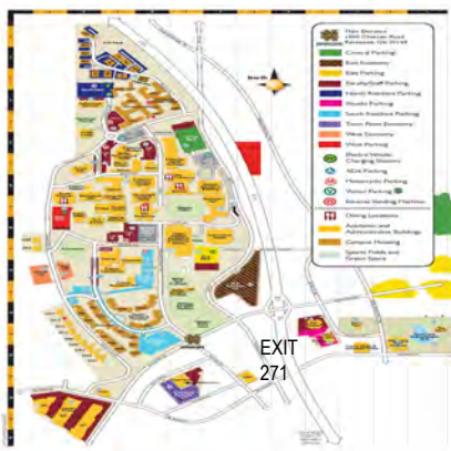
The program's face-to-face sessions, which we call the Application Labs , are held at the KSU Center located just east of I-75, Exit 271 - Chastain Rd.